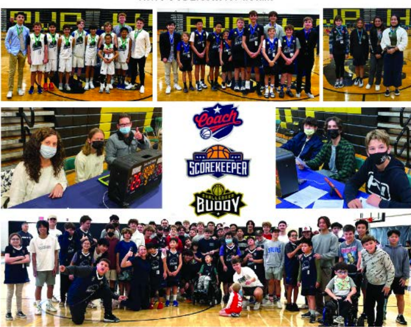
PVYBL is not related to, sponsored by, or endorsed by the Palos Verdes Peninsula Unified School District

Make a difference in the lives of 1,500 kids while earning volunteer hours! Season from December 7, 2024 to February 16, 2025 Mandatory training on Sunday, October 27, 2024 Visit PVYBL.com for details